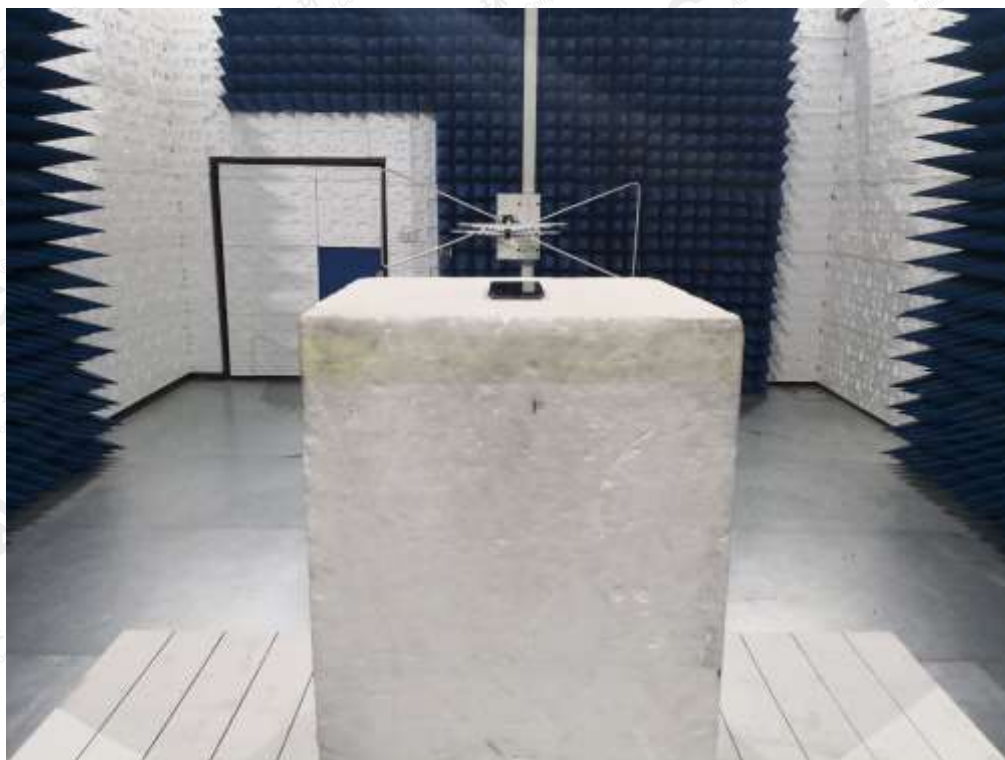
RADIATED SPURIOUS EMISSION ABOVE 1G TEST SETUP