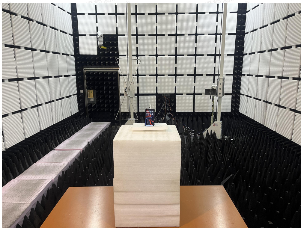
Spurious Emission below 1GHz & above 1GHz